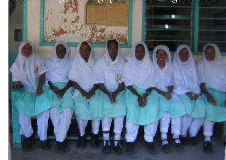
Some of the girls being sponsored through ILHAM